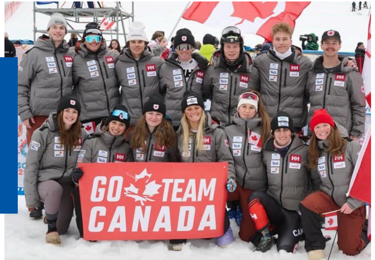
World Junior Ski Championships – 2025 Alpine Canada Junior Ski Team in Tarvisio, Italy (I'm in the back row, first on the left).

I'm staying with the BC Ski Team and fully committed to qualifying next season through Automatic Nomination which is Top 5 in a Nor-Am discipline . With even more focused training and international competition ahead, I'm aiming to make that next step.